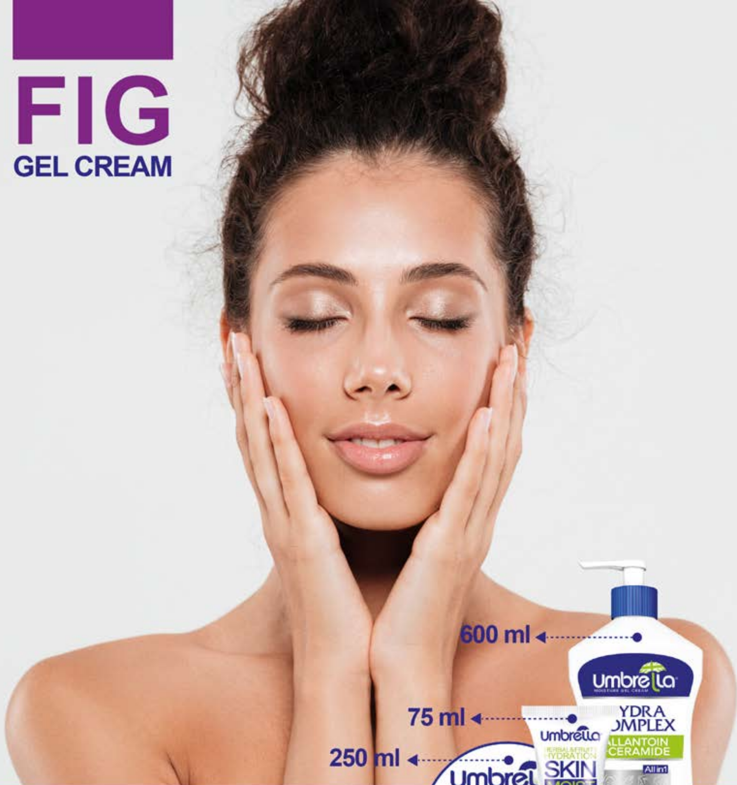
FIG GEL CREAM